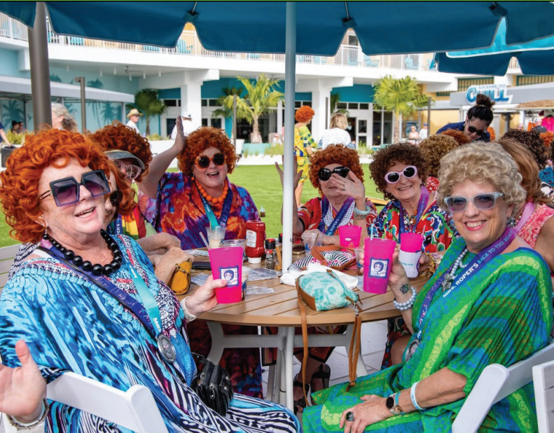
continued from page 9

paying their own way at each stop. Every restaurant, however, offered a 'Helen Roper' special. When it was all said-&-done, we made over $11,000 so that FMB Strong can continue to assist FMB in recovering from Hurricane Ian."