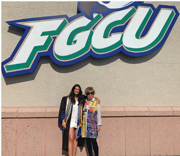
Bridgette graduated from FGCU with a Bachelor's degree in Neuropsychology.

the Holidays, renowned for Christmas donations delivered to island children by Fort Myers Beach fire trucks.