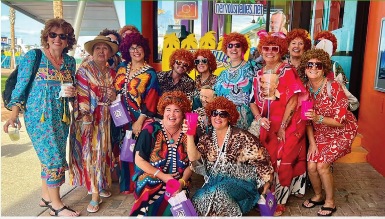
"Everywhere you went, people yelled, 'Hi Helen!' That sea of red wigs on FMB was absolutely amazing!"