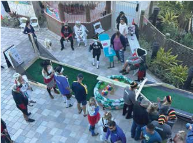
Golfers voted the Lah De Dah at the Margaritaville Beach Resort FMB as the Best Hole.