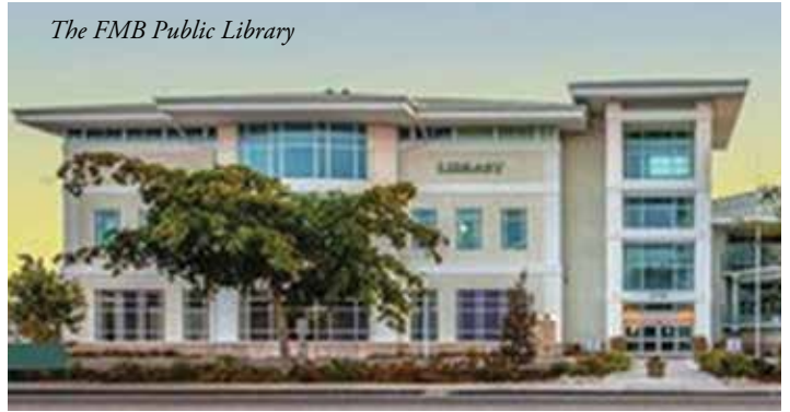
The FMB Public Library

As always, updates on our progress are on the Fort Myers Beach Library's Facebook page. We look forward to opening our doors in the near future and welcoming back visitors and members of the Beach Community! ■