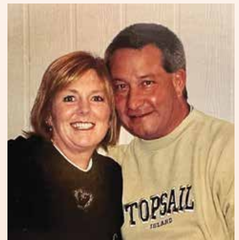
Valentine's Day 2007