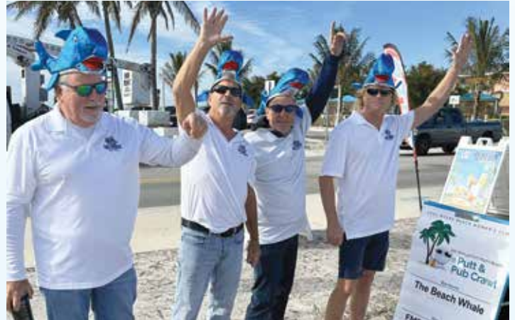
"The Whalers" are your 2024 Putt & Pub Crawl 1st Place Winners.