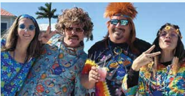
Foursomes dressing in outlandish costumes is a Putt & Pub Crawl Tradition.