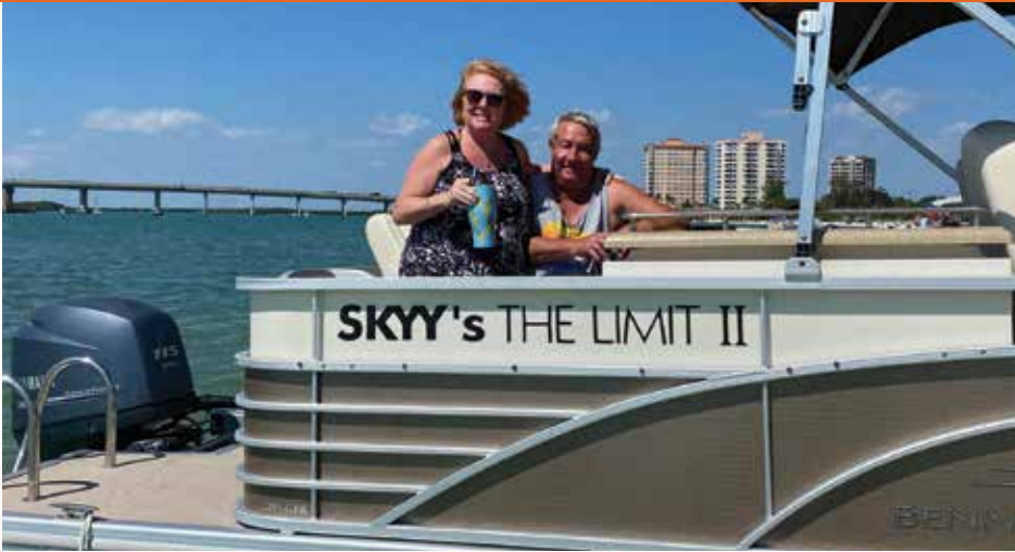
Out of the water for a day of fun & sun!