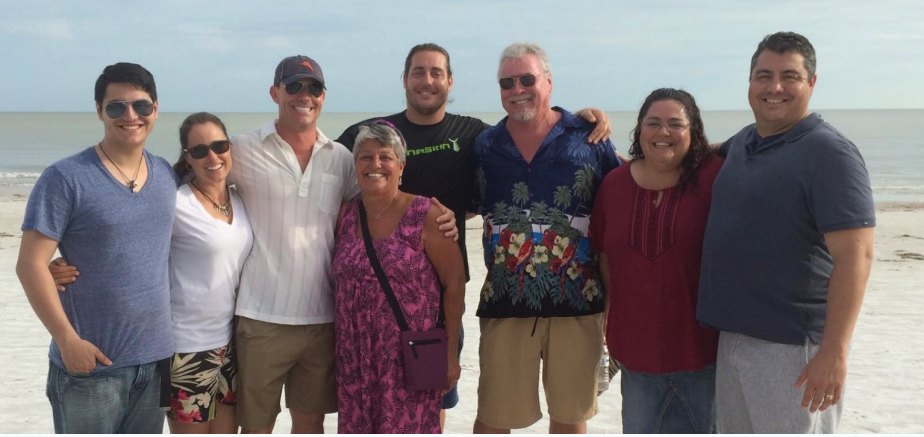
"Having all our kids and grandkids local is pure joy."