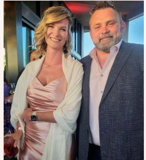
“Like so many others, we found a different type of happiness here, where people really get it.”