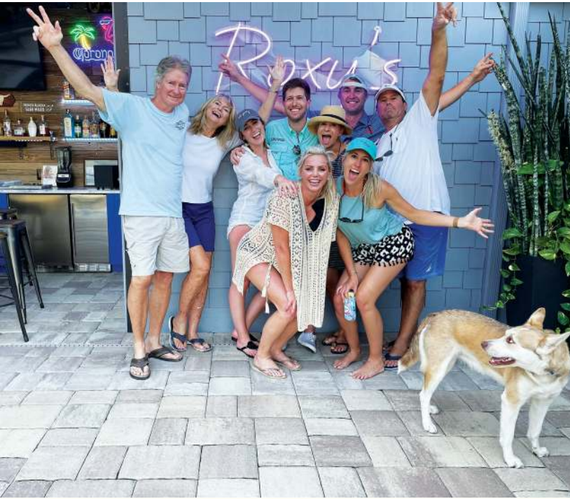
"I thought I would like to live in a cool place . . . and I was right – FMB is Cool!"