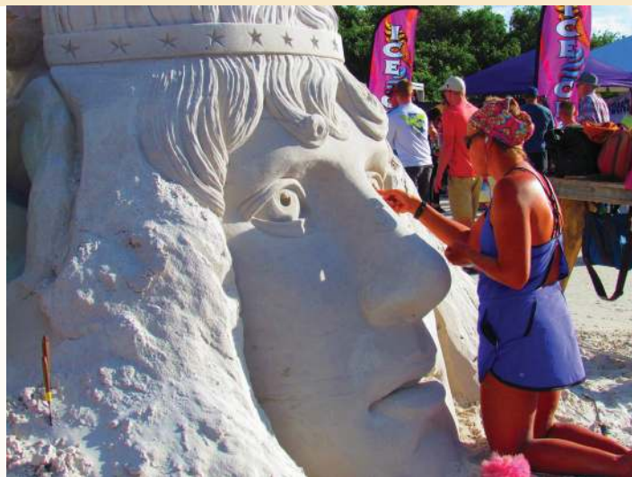
The DiamondHead Beach Resort is the host site of the American Sand Sculpting Championship.