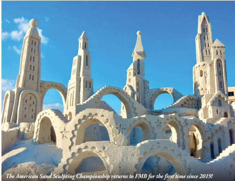
The American Sand Sculpting Championship returns to FMB for the first time since 2019!