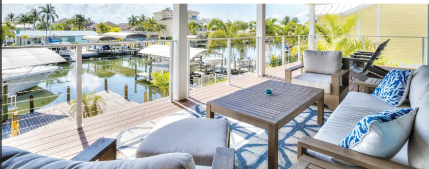
Bayside Building has committed to donate a portion of each job's proceeds to FMBStrong as our way of assisting in post-storm humanitarian relief as long as it's needed in our area.