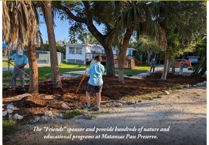
The "Friends" sponsor and provide hundreds of nature and educational programs at Matanzas Pass Preserve.