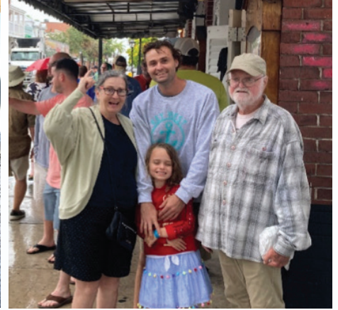
"Our residents are the best and the environment is wonderful."