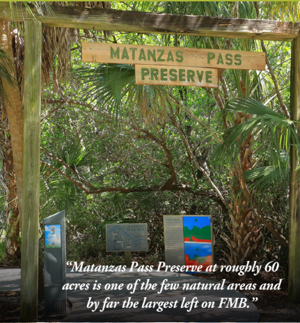
"Matanzas Pass Preserve at roughly 60 acres is one of the few natural areas and by far the largest left on FMB."