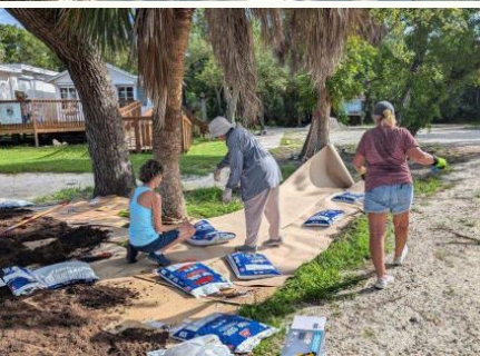
"We are presently restoring the planting area at the MPP entrance with barrier island native plants with identification placards, to show islanders and visitors what types of beautiful plants will survive best on FMB."