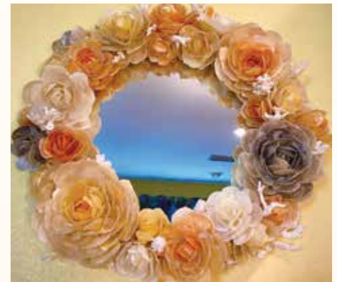
Sandy’s passion for shells and art come together in masterpieces like these created by her.