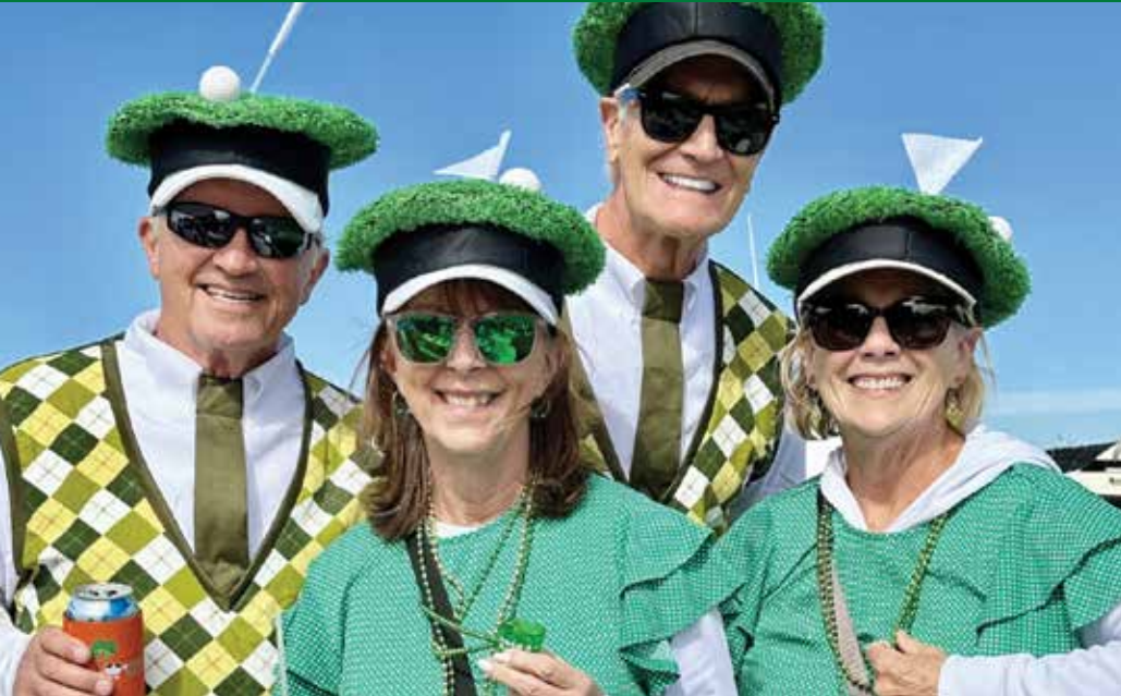
The distinctive and colorful Team Costumes are a beloved "Putt & Pub Crawl" tradition!