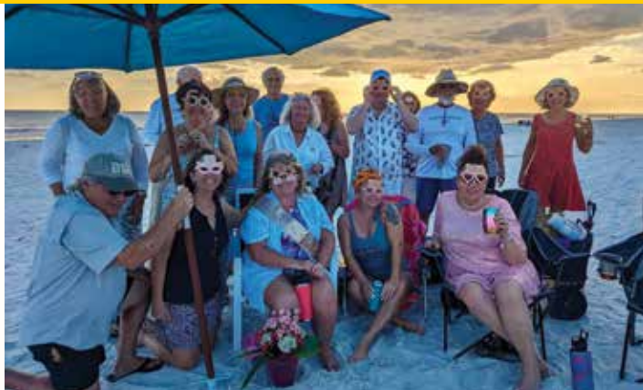
Turning “60” isn’t so bad when you have a wonderful group of neighborhood friends to celebrate with you!

Paper ’ was the moral compass of our community and I loved working for an entity that placed high morals standards above everything else. You might disagree with our stories but you could never say that we had an agenda or because our reporting had honesty and integrity. I thought that the newspaper’s tagline said it all: ‘Written By Islanders For Islanders!’ We had the trust of almost the entire FMB community and it was an honor to work there. I hope that is the vibe we give off with ‘FMB LIVING Magazine’ today.”