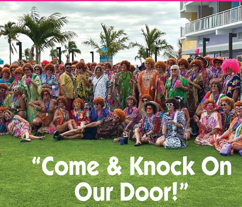
The "Caftan Crawl" begins & ends at the "License to Chill Bar & Grill" at the Margaritaville Beach Resort FMB.

From 11:00 a.m. until 4:30 p.m., the "Helens" will make their way to eight popular Fort Myers Beach bars and restaurants, enjoying themed drinks, laughter, and camaraderie along the way. The crawl concludes back at License to Chill with a closing ceremony at 4:30 p.m.