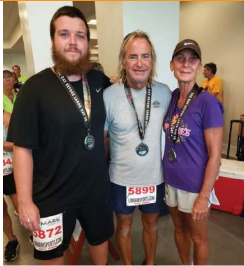
The Loughreys "run together and compete in races, triathlons and marathons."